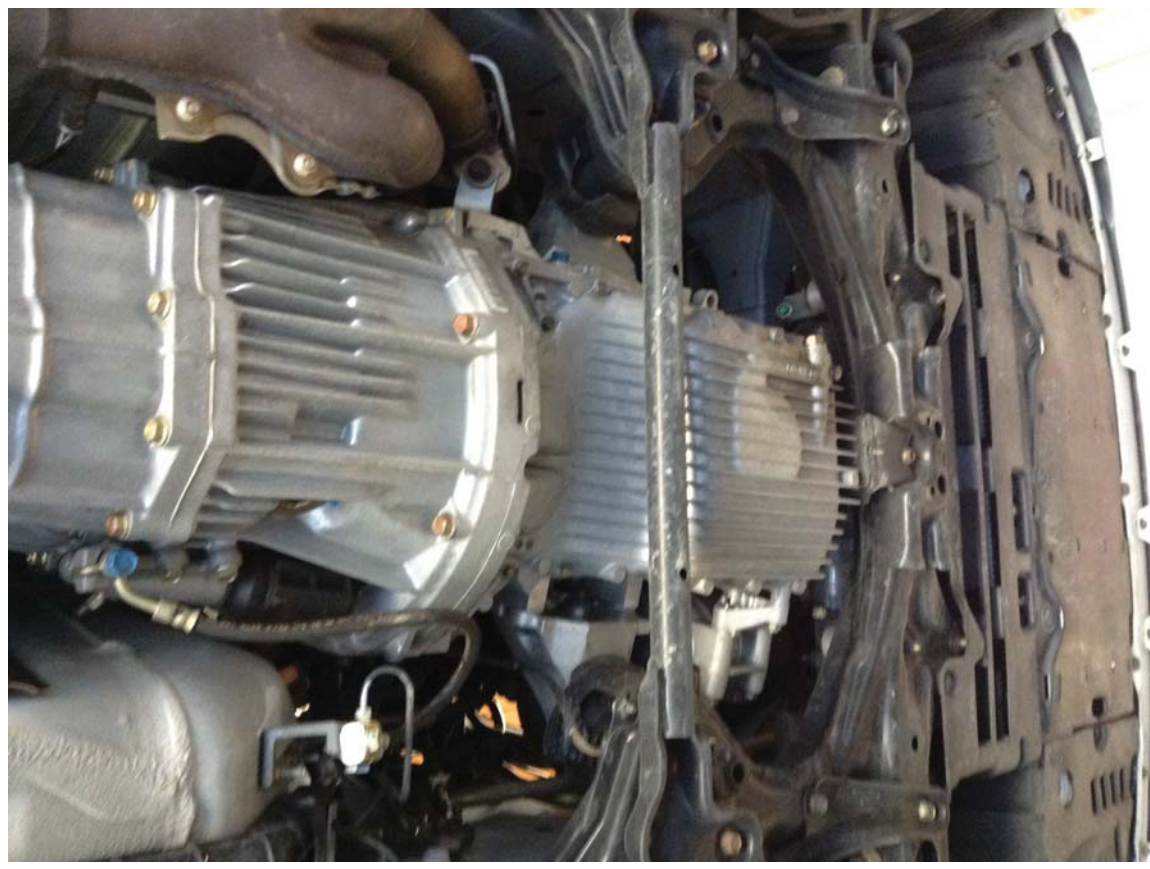
(Vehicle Picture. Picture 2 of 5)