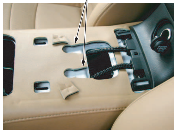
Cut out the center floor mat.