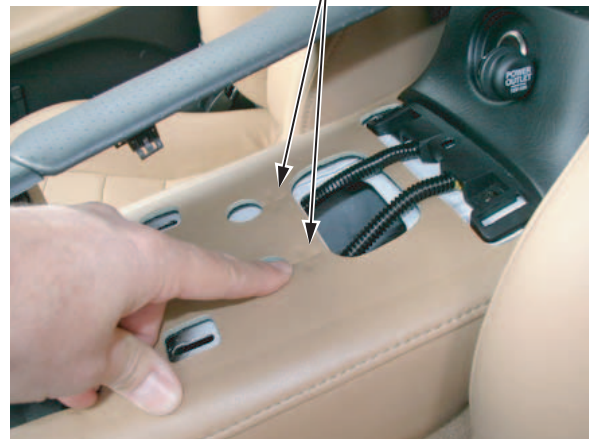
INDENTATIONS IN CENTER FLOOR MAT